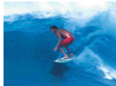
Watching the pros navigate the Banzai Pipeline is enthralling (and free!).

Bekah Wright is a freelance writer based in Sherman Oaks.