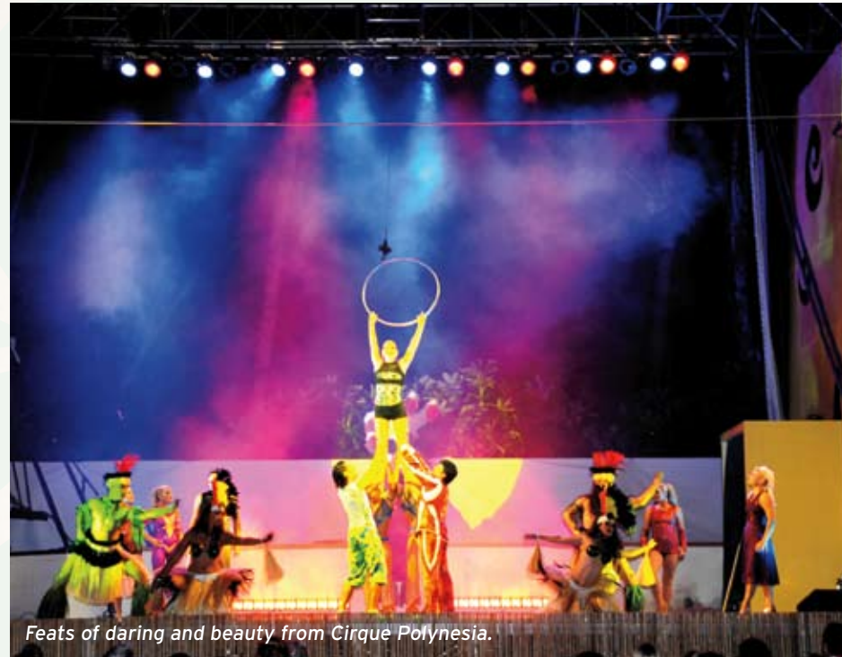
Feats of daring and beauty from Cirque Polynesia.