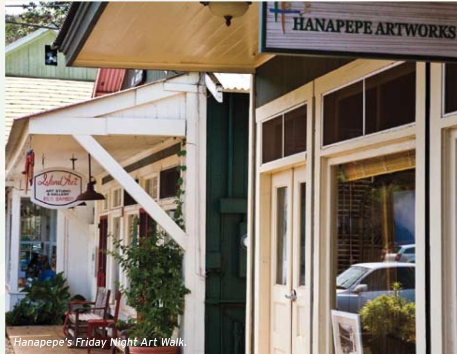
Hanapepe's Friday Night Art Walk.