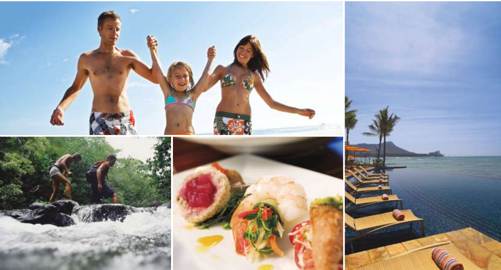
Sheraton Waikiki; The Royal Hawaiian, a Luxury Collection Resort, Waikiki; Moana Surfrider, A Westin Resort & Spa; Sheraton Princess Kaiulani