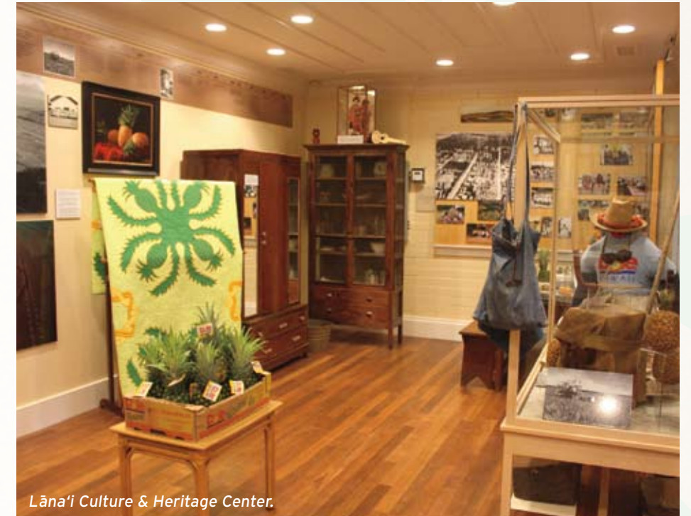
Lāna'i Culture & Heritage Center.

Hungry to experience more of Lāna'i's past? Recently opened through the LCHC efforts is the Kapihaa Village Trail. Located on 28 acres on the leeward side of the island, the interpretive trail through this ancient village is a veritable one-mile roundtrip walk into Lāna'i's history. Fifteen sites and more than 60 features in the preservation area give glimpses into how Lāna'i residents lived, worked and worshipped there over 200 years ago. The LCHC is open Monday through Friday from 8:30 a.m. to 3:30 p.m. and Saturdays from 9 a.m. to 1 p.m. To learn more about the Lāna'i Culture & Heritage Center visit www.lanaichc.org or phone 808-565-7177.