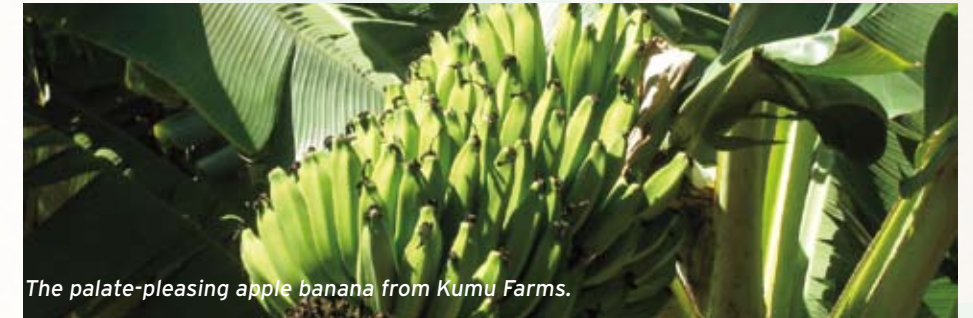
The palate-pleasing apple banana from Kumu Farms.