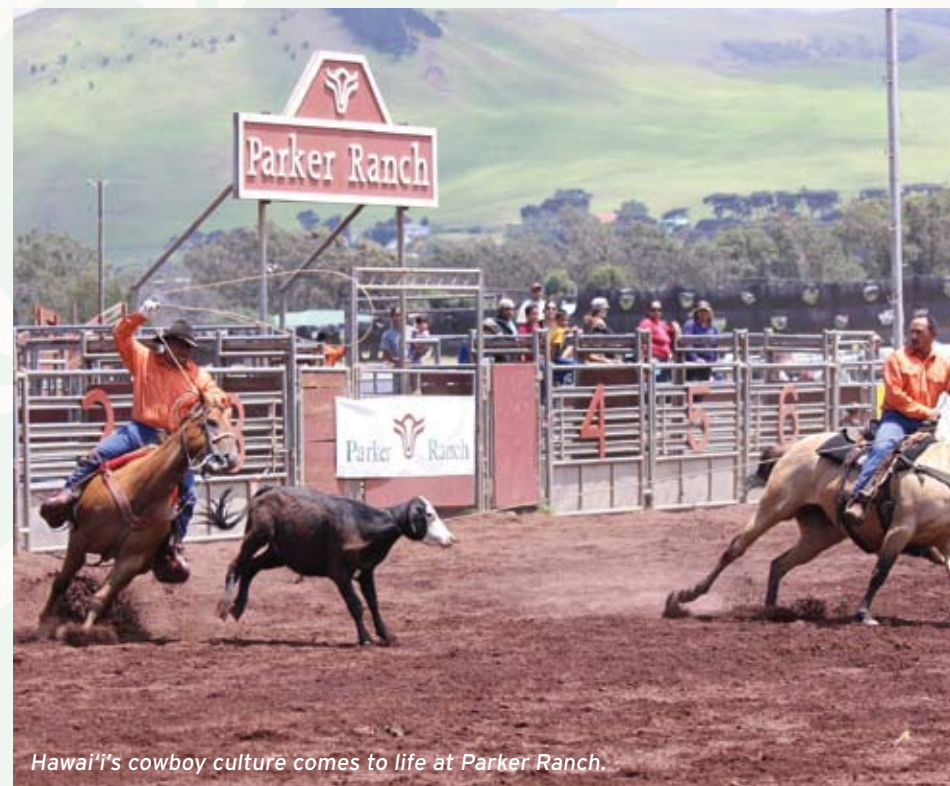
Hawai'i's cowboy culture comes to life at Parker Ranch.