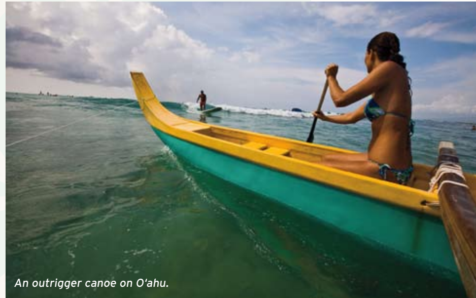
An outrigger canoe on O'ahu.

Walkabouts available Thursdays from 9:30 a.m. to 10:30 a.m., Farmers' Market open Tuesday through Friday from 9